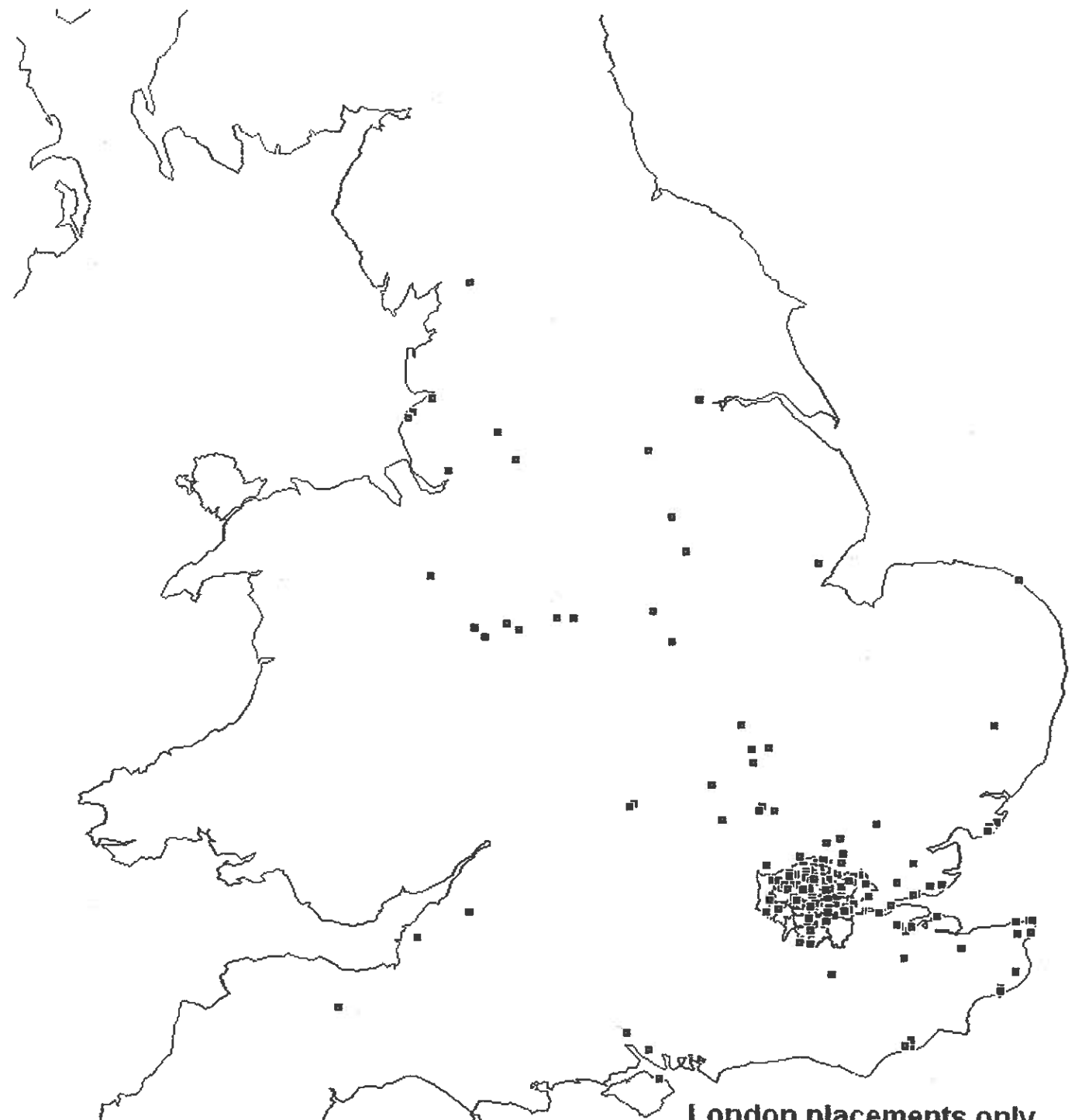
London placements only